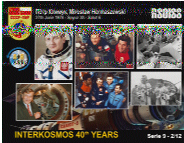
Figure 3: GNURadio Companion flow graph for acquiring and processing data.

The “Results” section demonstrates that the concept introduced earlier and implemented following the Experimental Setup description are actually functional.